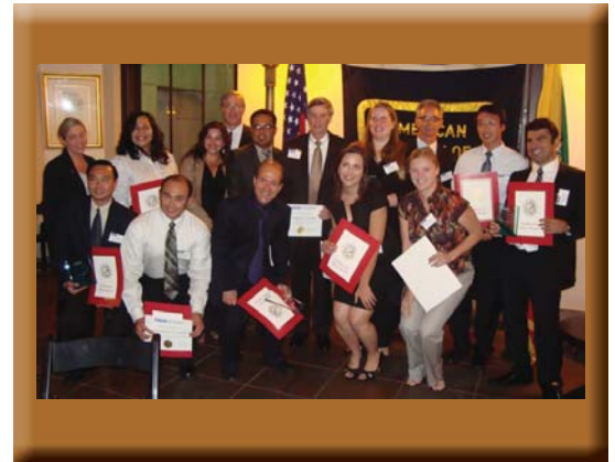
Past and new MLAB & MLAB YMF officers and chairs