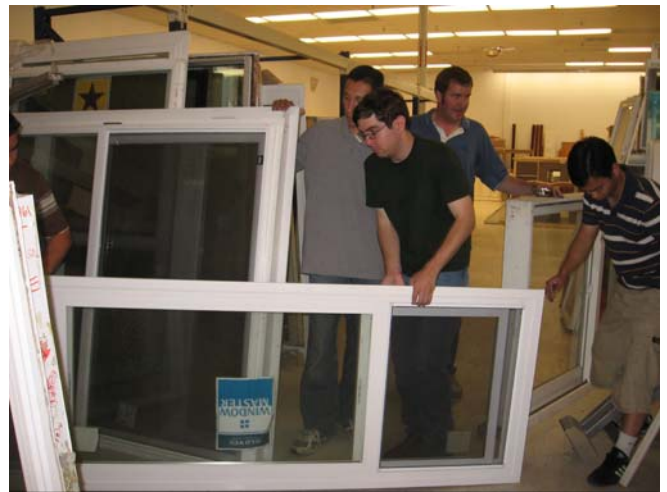
OC-YMF volunteers sorting windows at the ReStore

So although ASCE-YMF did not nail roofs down, paint exterior walls, or dig irrigation trenches on this volunteering assignment, we were still able to help out Habitat for Humanity-Orange County with its mission. New donations come in on a regular basis, so the store never looks exactly the same, thereby enticing customers to return.